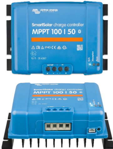
SmartSolar Charge Controller MPPT 100/50