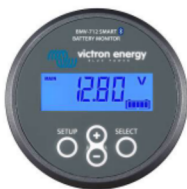
Bluetooth sensing BMV-712 Smart Battery Monitor