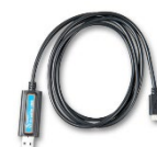
VE.Direct to USB interface