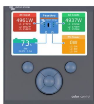
Color Control GX