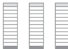
32 x LITEIN 82.5